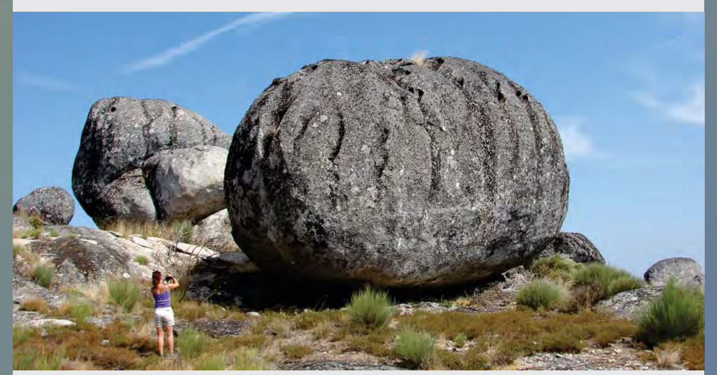
October – Proposal for the classification as Protected Landscape of Serra da Gardunha. The proposal, who aims the classification process as Protected Landscape Serra da Gardunha was approved unanimously in the Municipal Assembly of Castelo Branco. Among the highlighted values which support this proposal, are included the Geological Heritage and the hydrogeological wealth. This is a process which involves the Castelo Branco and Fundão municipalities and covers a 10 500 hectares area, of which 2 500 hectares are included in Geopark Naturtejo area. This classification is justified by the "aesthetic, ecologic and cultural value".

October – Nisa-a-Velha site classified. The archaeological/architectonical site of Nossa Senhora da Graça, in the area where Nisa primarily appeared, was protected as a National Public Interest Site. This site is constituted by the Castro, Nossa Senhora da Graça chapel, Cruzeiro, Santiago Church Ruins, Superficial Findings, Fonte Coberta, Fonte Soterrada and other fountains, the chapel "dos Fiéis de Deus", Nossa Senhora dos Prazeres chapel, Via Calçada stone road and Nossa Senhora da Graça Bridge.