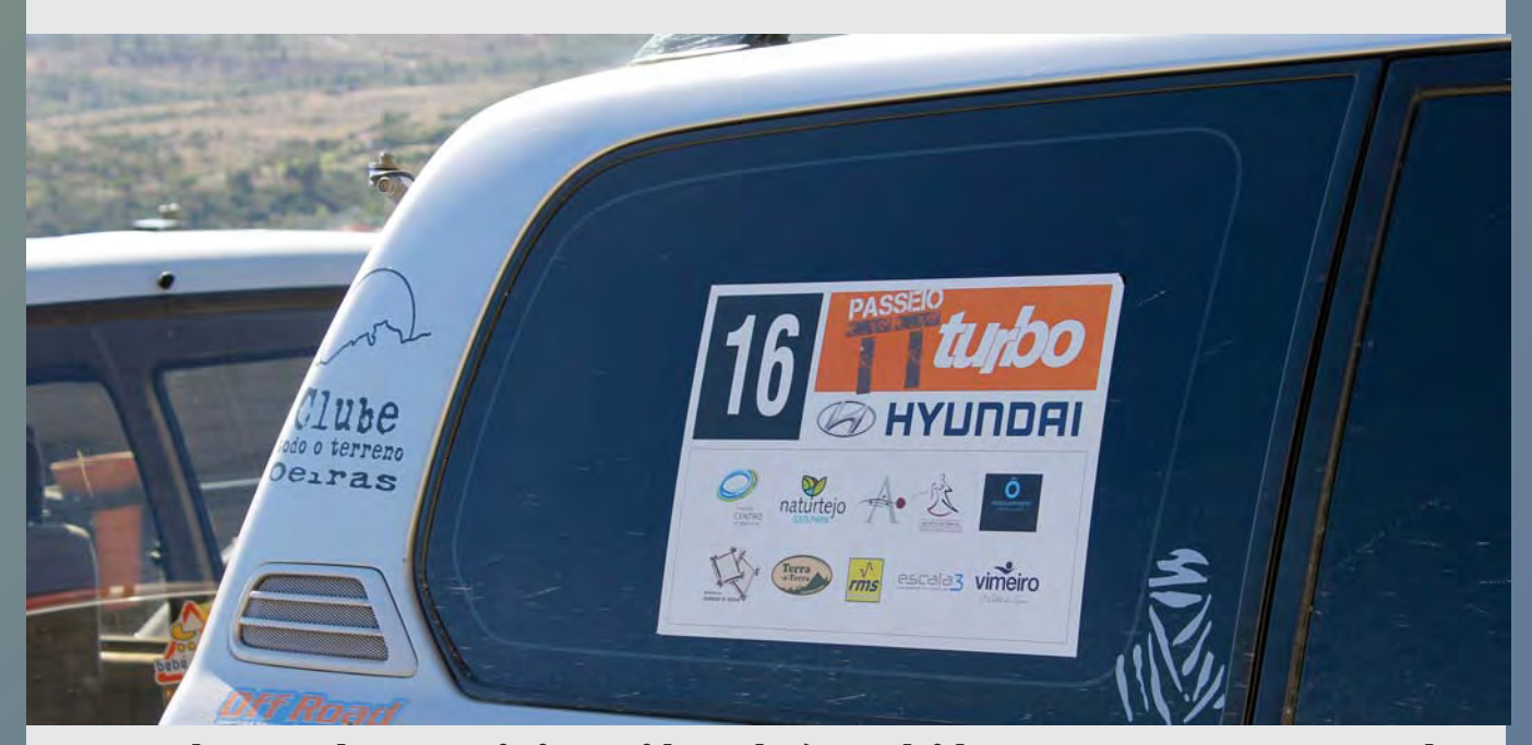
27 and 28 October – Touristic TT Ride Turbo/Hyundai between Proença-a-Nova and Termas de Monfortinho

26 to 28 October – "Earth Flavours" brings Adraces. The Regional Development Association of the Central South Region of Raia gathered the European partners of a gastronomic route project in which the team of Geopark Naturtejo have been involved technically. The 15 person group pay a visit to some of the points of interest outlined by the Geopark. They began by meeting the Cooperative of the Beira Baixa Cheese Producers, in Idanha-a-Nova, where they taste some of the best cheese in the world, as they were recognized this year. Thereafter, they found the "Lagar de Varas" in the Historical Village of Idanha-a-Velha. Already in Ladoeiro, they meet a modern olive oil unit production, the Coopagrol, Where they tasted its excellent olive oil. To conclude the visit, a lunch at the Helana restaurant, in Idanha-a-Nova, gathered some of the local traditional dishes such as the "Tiborna de Bacalhau" well provided of local olive oil, olives and handcraft sheep butter, Súbito Geowine and the regional "Papas de Carolo".